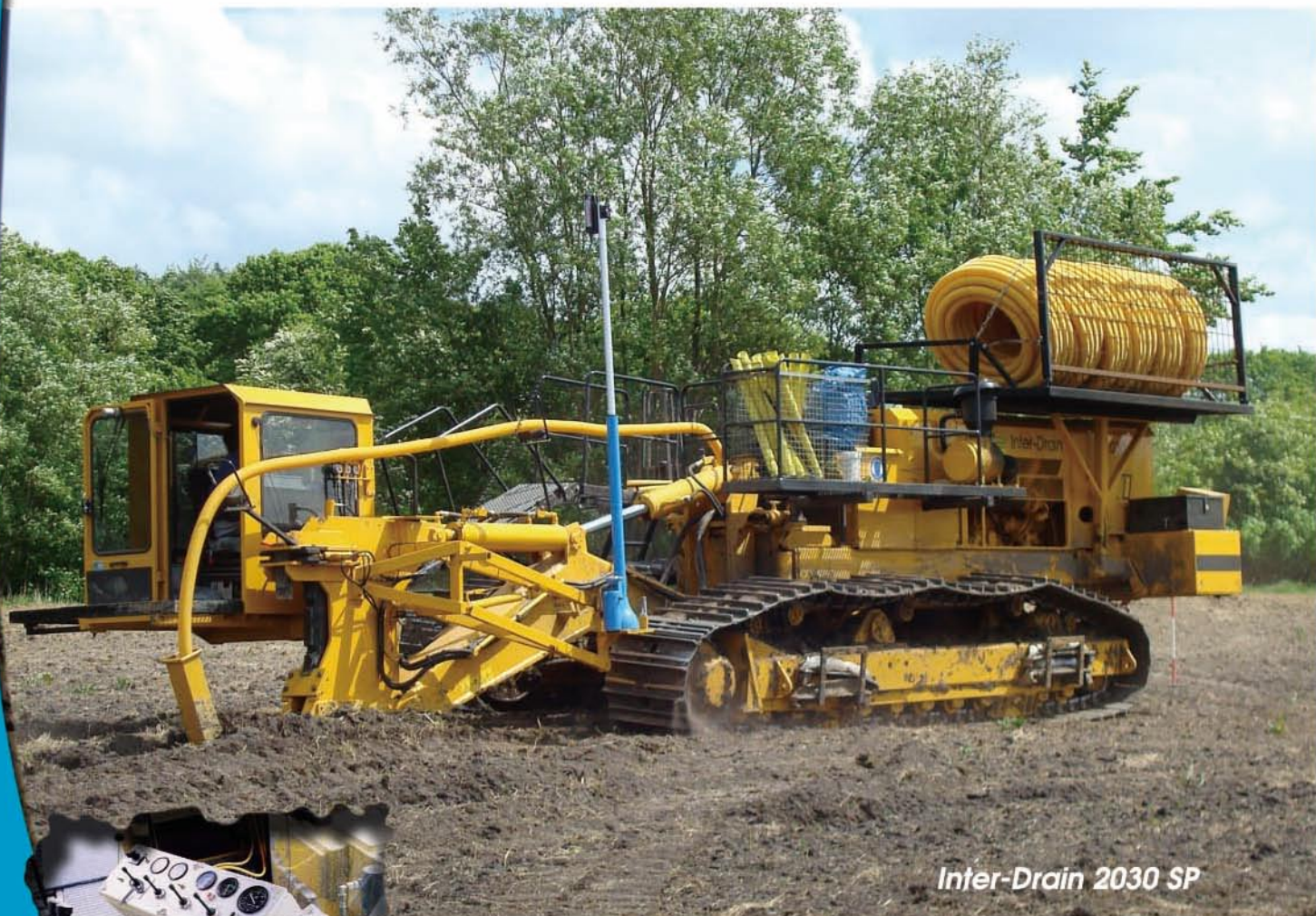
Inter-Drain 2030 SP